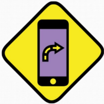
Buy a Pass